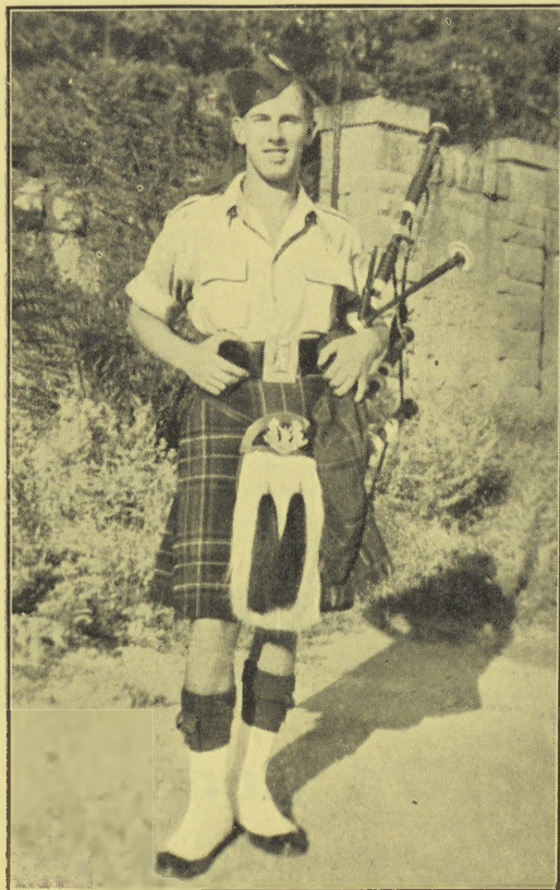
THE AMATEUR CHAMPION, 1950.

Registered for transmission to Canada and Newfoundland.